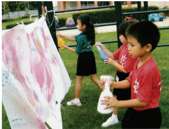
Sheet Painting by Kg. 3 students